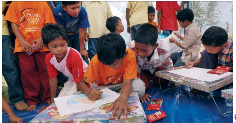
Art therapy for children involved in the Asian tsunami

Psychotherapy and counselling must be differentiated from each other. Counselling is for mild disorders related to personal, social, and decision-making problems. The focus is educational and developmental concerns. By contrast, psychotherapy deals with serious disorders and